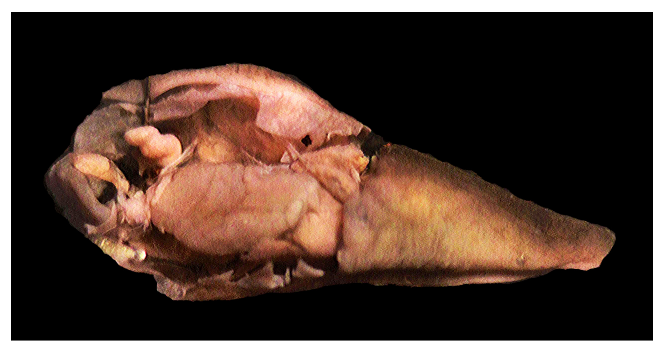
Fig. 4. Deroceras laeve, situs viscerum showing the proximal parts of the genital tract in situ. The pin is used to lift the diagnostic twisted penis