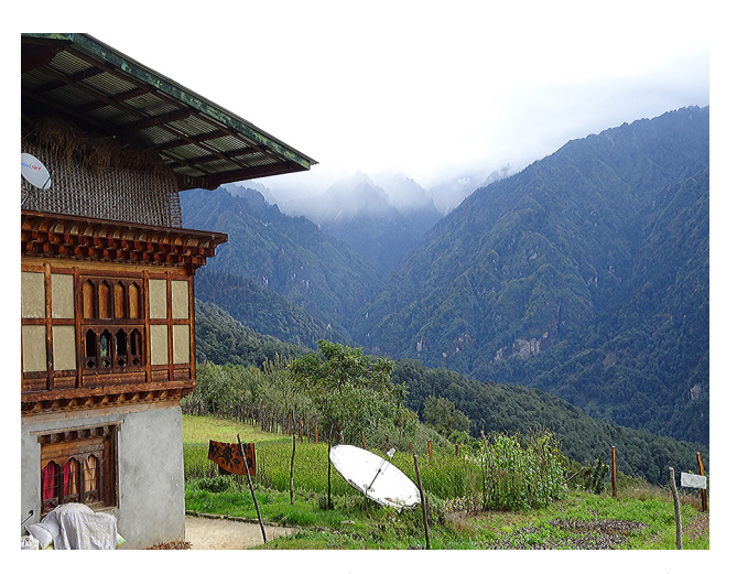
Fig. 2. The farm near Gasa

The preserved slugs (Fig. 3) are slender with a blunt dorsal keel near the end of the tail; the mantle measures a little less than half the total body size. The dorsal part of the slug is rather dark, brownish grey, with fine irregular spots. Towards the sides the animals become gradually much lighter in colour.