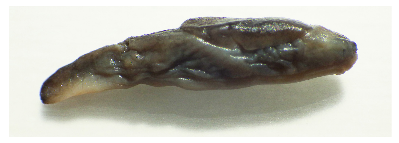
Fig. 3. Deroceras laeve preserved in 70% ethanol. Near Gasa as in Figs 1 and 2. Length 17 mm

The three dissected slugs were all sexually mature. Two of these were euphallic, i.e. provided with a fully developed male part of the genital tract, whereas the smallest one was aphallic, i.e. with only a rudimentary penis. The penis of the euphallic slugs, illustrated in situ (Fig. 4) and prepared (Figs 5, 6), is a slender, twisted tube without any appendices.