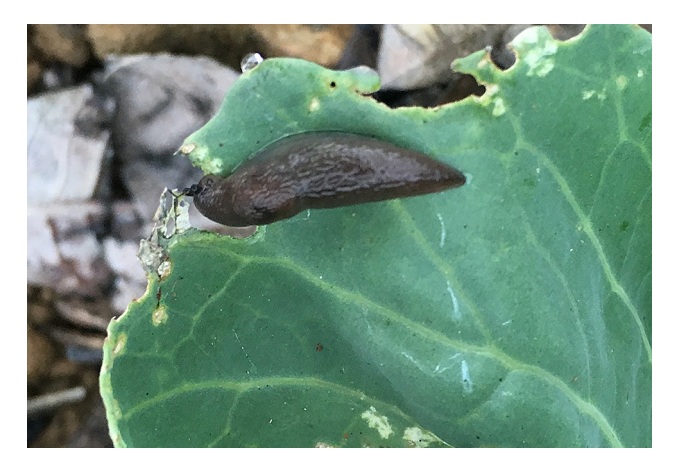
Fig. 1. Deroceras laeve damaging cabbage near Gasa

Bhutan is a small mountainous Himalayan country. The agricultural sector is small but important, with 56.2% of people employed in farming (RNR 2015). A major plant protection research and development programme was conducted in Bhutan from 1985 to 2000 (DOE DOE 2009), and this included the production of a checklist of insects and mites (BIGGER et al. 1988). Molluscs were not referred to in the checklist, are not represented in the National Plant Protection Centre Collection, and to our knowledge were not recorded in reports and extension material subsequently produced during that programme. Slugs were found damaging cabbages (Fig. 1) during a farm visit in 2016. Samples were sent to the first author for identification within the scope of a more general inventory of the molluscan