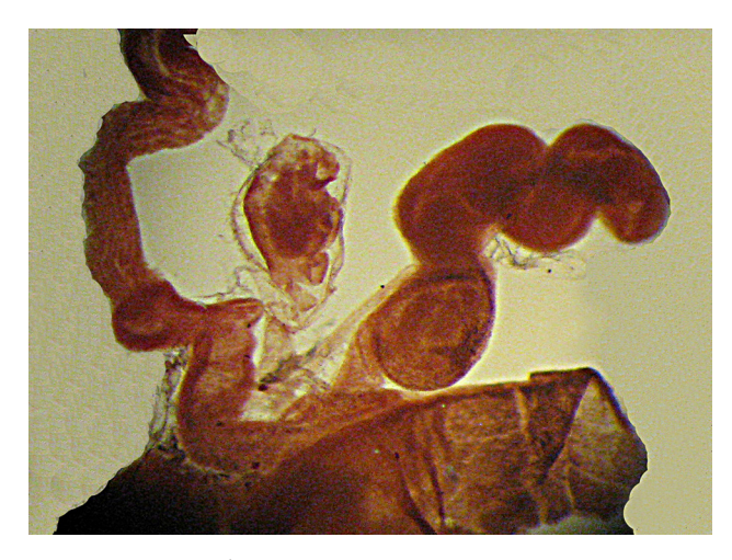
Fig. 5. Deroceras laeve , anterior parts of genital tract, photographed. From left to right: oviductus, spermatheca and penis (see Fig. 6)